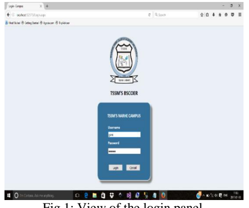
Fig 1: View of the login panel

The teacher's page contains a login page why the user to provide the information about the password. If the provided username and password then it allow the user to go on the next page the options for the teachers.